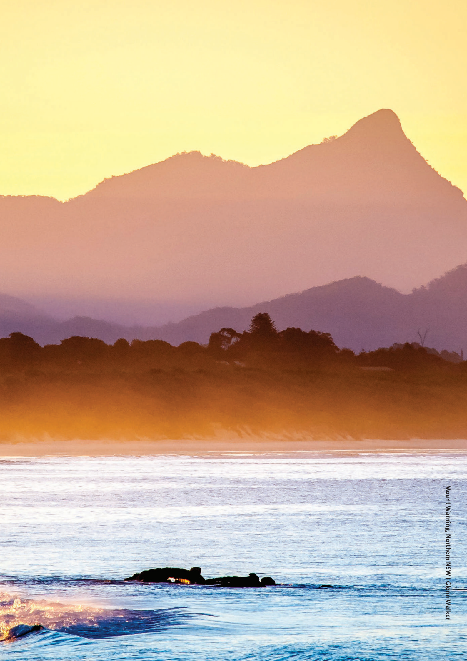
Mount Warning, Northern NSW