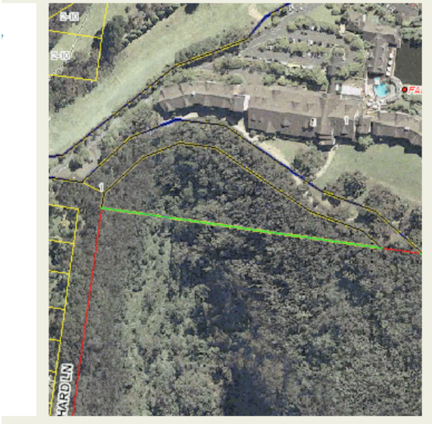
Council aerial mapping (date unknown) showing boundary of national park (green) and no road present