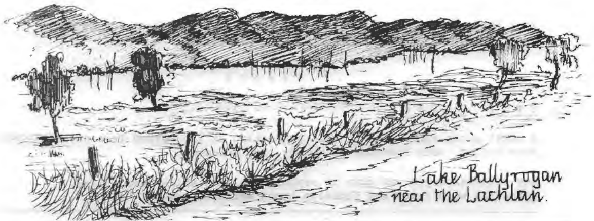
Lake Ballyrogan near the Lachlan.

The paddocks are clear of any competing trees or the lucky survivors are on their last legs through sheer age. Stock see to it that there are no descendants. The next generation of Australians will quite likely see and accept an absence of trees on all agricultural land. It's an area for all good birdos to hurry through though it was hard to resist the temptation to divert to the distant blue haze of some national parks and little patches of crown land just in case "we might see something",