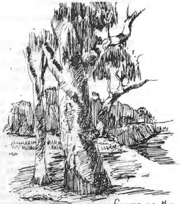
Gums on the Lachlan.

Lake Ballyrogan or Brewster was our next goal. A weir across the Lachlan diverts water over a depression which can be re-diverted downstream when the river falls. Sturdy specimens of Red Gum grew along the water margins and hosts of water fowl enticed the party to study them despite a very cold southerly drifting over the plains.