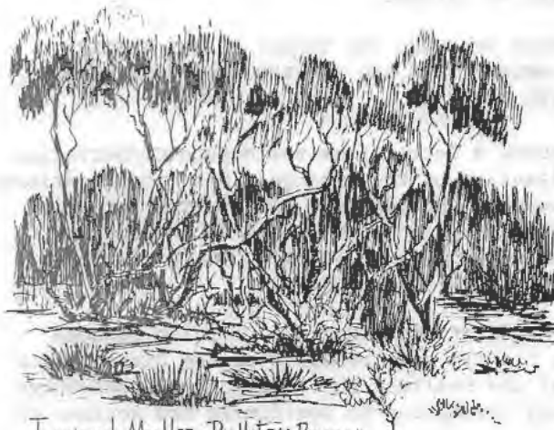
Typical Mallee-Pulletop Reserve near Griffith

And so on to Mt. Hope Mallee Reserve via Lake Cargellico. From a high knoll we could see a full 360° of mallee wilderness blanketing the plains. To the east however we could see neat rectangles of freshly sprung wheat penetrating westward. In this marginal country one wonders if the farmers' democratic right to make an economic gamble is fair to the nation in their effect on the land's stability when seasons fail.