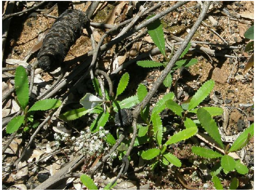
Burnt Newnes Plateau Banksia cones among regenerating seedlings.

Like many, I was looking forward to a display of Pink Flannel Flowers ( Actinotus forsythii ) this summer and have not been disappointed. They appear the summer after bushfires and are mostly found on exposed ridges - frequently with burnt Heath-leaved Banksias. I was concerned that they may be picked or trampled on, but the profusion of them in many locations in the