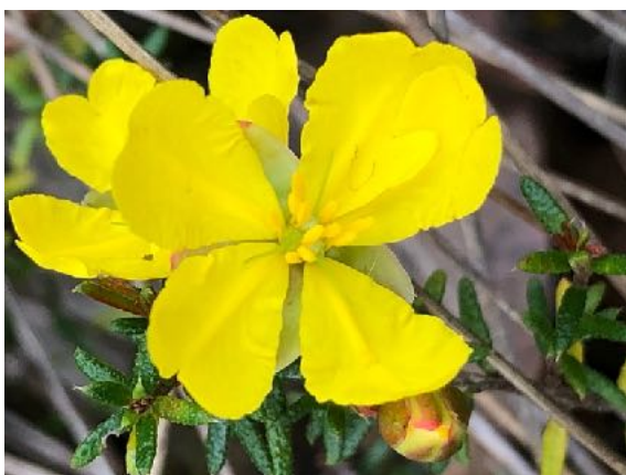
Hibbertia sp.

Eucalyptus mannifera ssp. gullicki Alluvial woodlands sheltered lovely flowering shrubs such as Boronia microphylla , Conospermum tenuifolium and Thelymitra orchids with their buds still closed on this cloudy morning. Kunzea capitata was pretty with pink flowers. Diuris sulphurea looked fresh and bright wearing its sulphuric yellow petals and sepals.