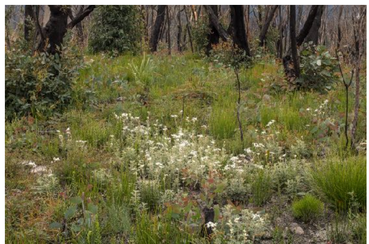
Above left: Summer growth of satin everlastings, eucalypt seedlings and wallaby grass, Newnes State Forest (and proposed Gardens of Stone State Conservation Area).

Neither of the inquiries could properly review fire operations. Not one scientific paper has yet been published on the subject. The government has never seen it as a useful line of research to support. Which methods worked the best? How effective were prescribed burns? Why did some back burns backfire?