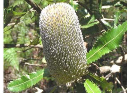
Summer: Old Man Banksia

The 2002 timeline can be found among Resources on the Society website, https://www.bluemountains.org.au/timeline/