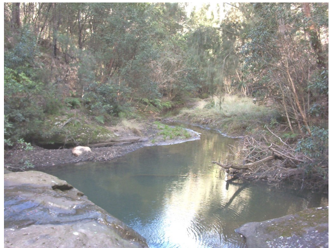
Cripple Creek below Mount Riverview

Imagine, during its lifetime, the countless number of birds and other wild life that visited it. Then consider those first, small changes that rapidly grew and destroyed it, until today it is no longer remembered. It's as if the creek never really existed for all those years.