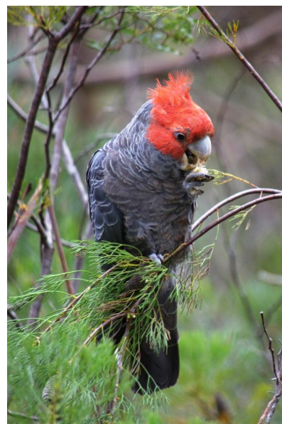
Image: Gang-gang feeding on Petrophile fruits on the Fairfax Track at Blackheath in 2012

Entering the Glen from Railway Parade – because on this track, at this time of year, the Boronia on the side of the gully perfumes the air as you descend to Gypsy Pool, I was surprised by the familiar 'creaking' sound of these lovely parrots. They seemed to be feeding in the Acacias by the road and then moved further into the forest as I walked by. It has been quite a while – years maybe – since I saw some of these birds in Woodford and it was a happy sight.