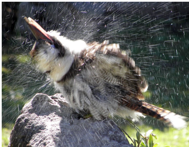
Kool Kookaburra—photographed by Mary.

Thirsty? Imagine how our feathered and furry friends feel in these very dry times. Yes, parched. We have a bird bath that I now clean-and top up most days. It's placed in the shade under a bushy tree which allows nervous little birds to access it without too many worries. While not always hearing or seeing birds using it, I do notice splashes around the rim.. And at night? Skinny-dipping possums perhaps. Alan Page.