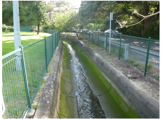
Rainbow Creek now a stormwater channel

Rainbow Creek had obviously been a valuable part of the natural environment. The Aboriginal people who first lived there had respected and cared for its survival. With the coming of Europeans, it was a convenient water supply for the sailors who repaired their ships in the cove and the colonial farmers and orchardists who began transforming the bushland.