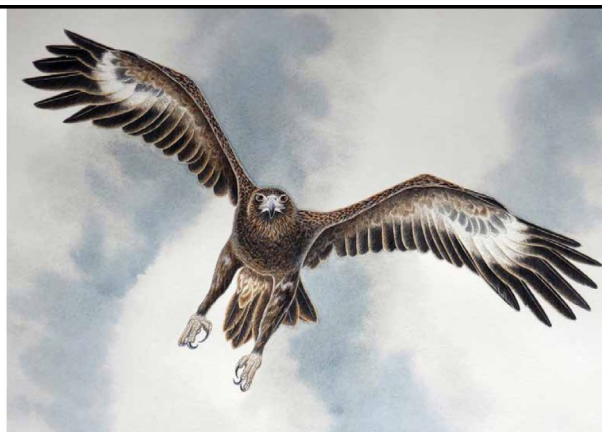
Steve Tredinnick In For The Kill - Wedge-tailed Eagle, watercolour, 57 x 37cm