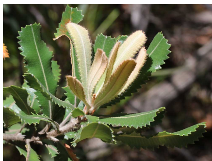
New growth of Banksia serrata (Old Man Banksia)

And Old Man Banksia. Gently feel its young leaves, and look to see whether its seed pods are open or closed - and have a guess at how old the seed pods may be.