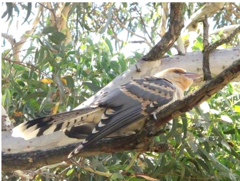
Juvenile Channel-billed Cuckoo: "feed me, feed me, feed me ..."

All through December we have heard the persistent call of the Koel and occasionally the raucous calls of the Channel-Bill. These two cuckoos migrate to eastern Australia from New Guinea and Indonesia and further north to breed. I heard a very loud baby bird calling in the bush out the back and went to investigate (Jan 2). The juvenile Channel-billed Cuckoo was much larger than its unfortunate Pied Currawong foster parent and called incessantly "feed me, feed me" or sounds to that effect. I wonder if they are the same currawongs who raised a young cuckoo last year and if the same adult cuckoos return to the same place to breed?