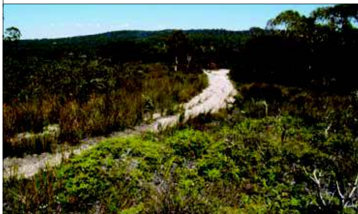
Trail-bike and 4WD damage to a Newnes Shrub Swamp