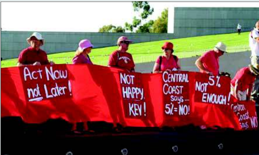
Part of the Climate Action Summit encircling of Parliament House.