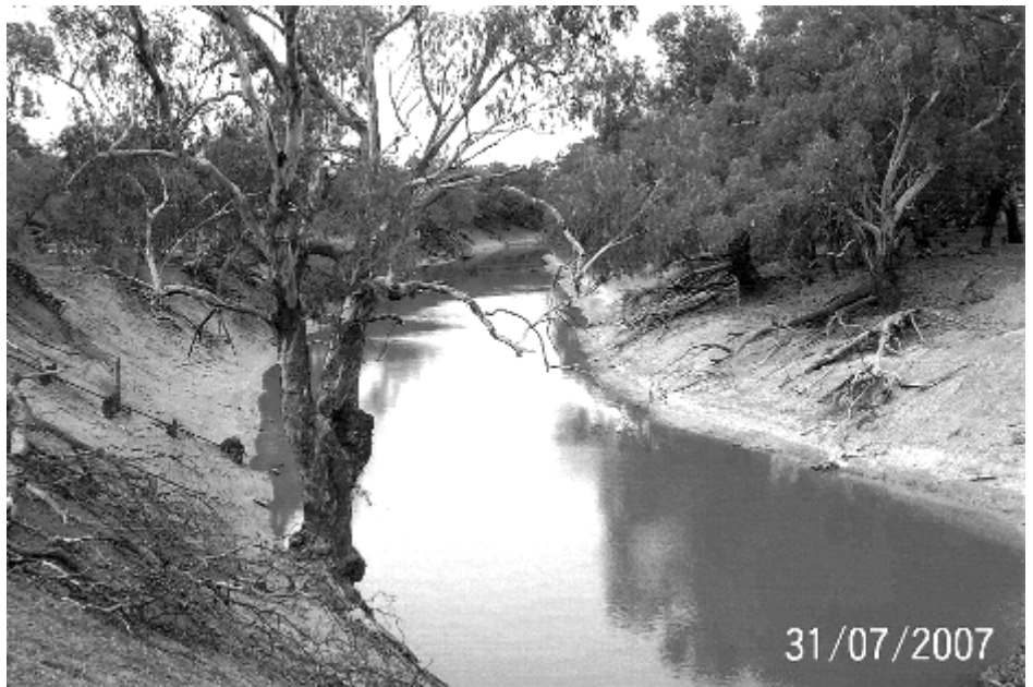
The Darling River

After 3 days in the Louth area, we started our return journey and set out on a dusty road to Cobar. To our delight Cobar had coffee shops! We saw a gold mine and read in the Cobar Weekly that climate change will increase the temperature, and the number of hot days above 35 degrees, from 41 up to 128 days per year by 2070. That's bloody hot and probably in drought too!