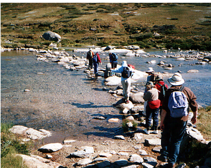
BMCS bushwalkers cross the headwaters of the Snowy River during January 2005.