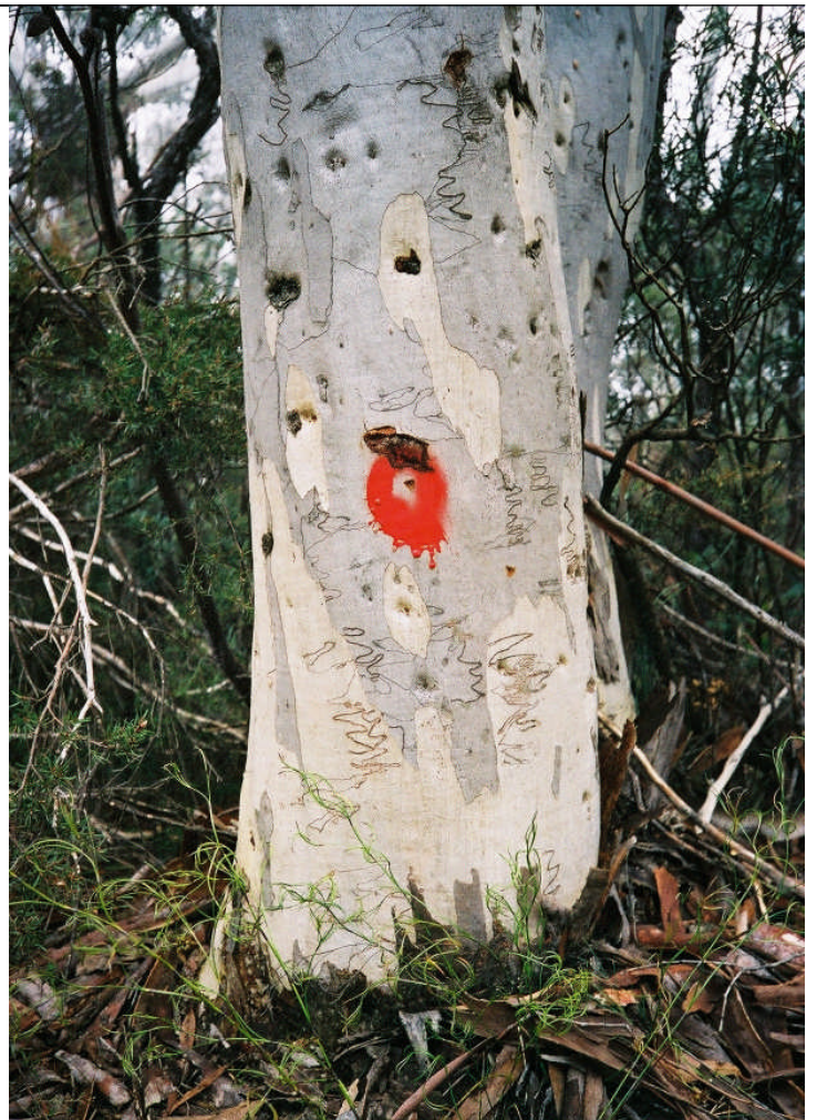
This tree stands on the Jamieson escarpment off Cliff Drive Katoomba. It is one of a number of mature Eucalypts due to be killed to make way for development in the next few months.

Soon they come They cast the red die on my girth, the red mark of death My death an extinction wedge When they scatter my woodchips on their plot Will they know I was once a Scribbly Gum, free and wild? Their photos a torment of treasure lost This wild country locked in myth Motors approach. A saw starts. No!