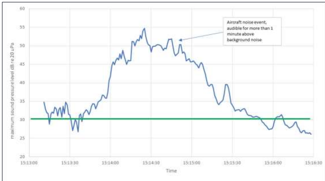
Figure 1: Example demonstration of aircraft noise intrusion – Blue Mountains National Park

Although the proposed number of average daily aircraft movements for Stage 1 of the Airport is relatively low compared with other Australian international airports, there is still potential that during a 'peak' day, up to 100 overflights could occur over particular areas of the Blue Mountains. This is projected to increase to 200 overflights per day in the future, as part of the long-term development of the Airport. This could therefore lead to a significant increase in the number of events of which would be audible in large areas over the Blue Mountains, and conversely, a significant decrease in the time periods in which the soundscape is unaffected by aircraft noise intrusion.