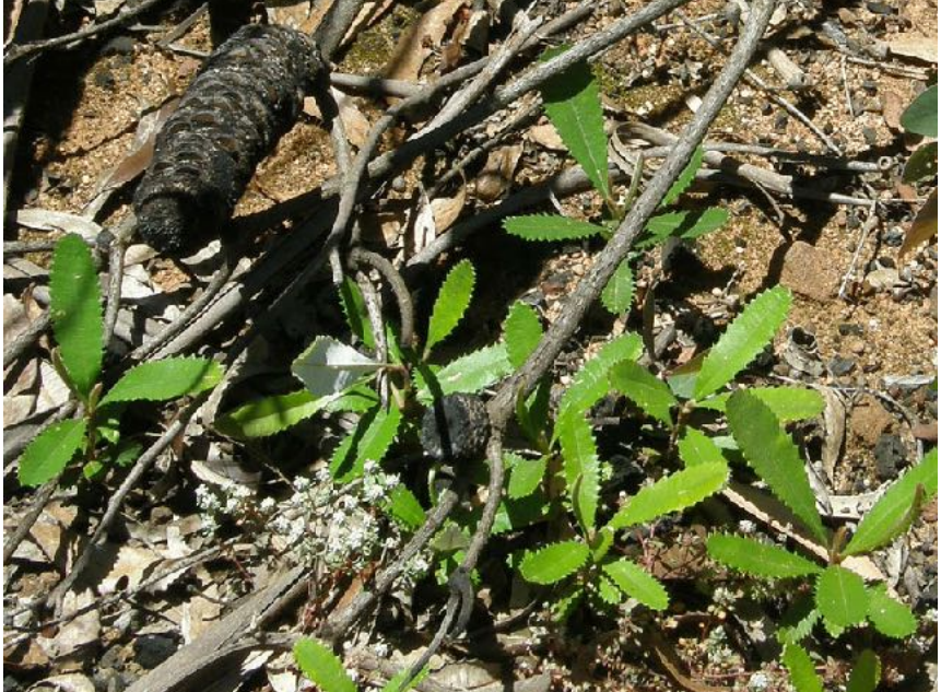
Burnt Newnes Plateau Banksia cones among regenerating seedlings.

Walking near, I sat in awe, The Elder, and me the child. A sense of oneness with this new-found friend, Together , sharing the wonders of the Wild.