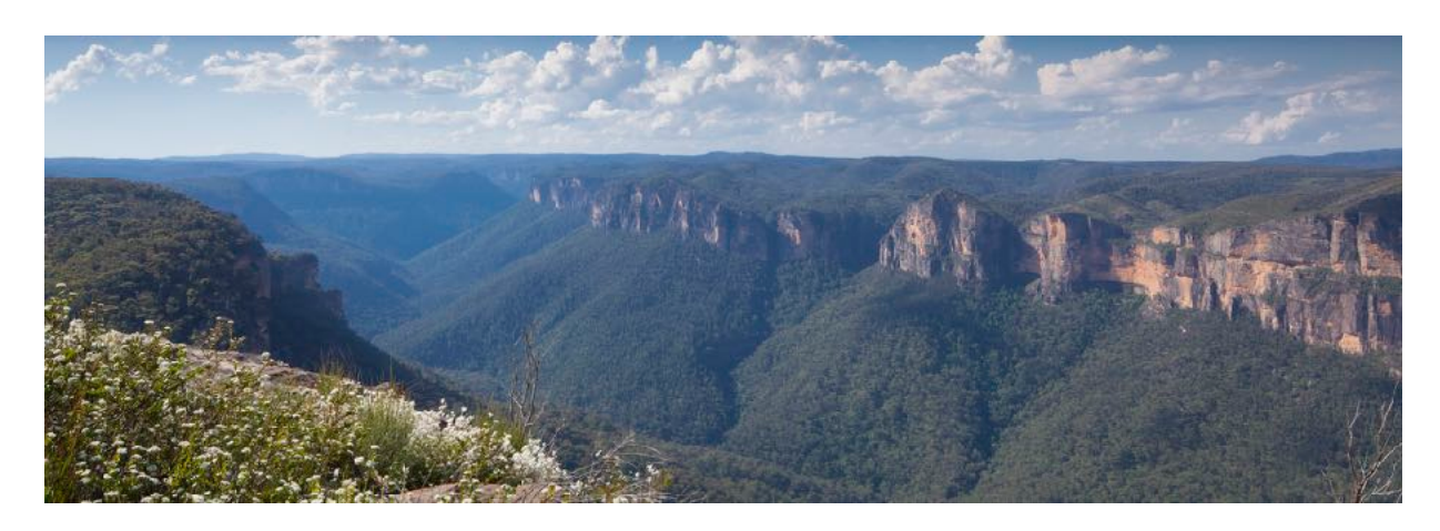
Looking up the Grose Valley from Anvil Rock.