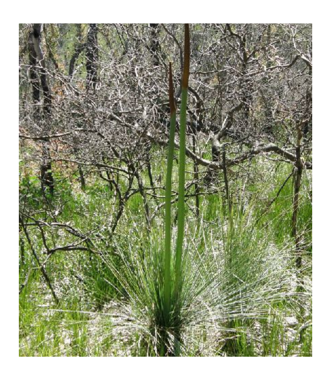
The Xanthorrhoeas (grass trees) are thriving on Narrow Neck.