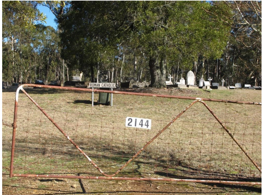
Shooters Hill cemetery, September 2018.

The vast majority of modern city and town dwellers will be bade goodbye without anybody finding space for a gravestone. So, wandering through the countryside and stopping by a place like this one is a step back in history.