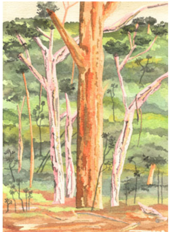
illustration by Jim Low