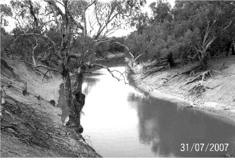
The Darling River

After 3 days in the Louth area, we started our return journey and set out on a dusty road to Cobar. To our delight Cobar had coffee shops! We saw a gold mine and read in the Cobar Weekly that climate change will increase the temperature, and the number of hot days above 35 degrees, from 41 up to 128 days per year by 2070. That's bloody hot and probably in drought too!