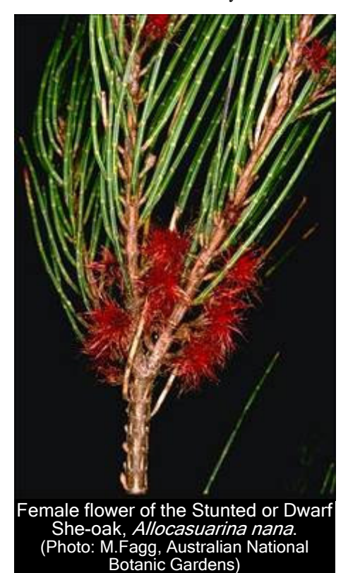
Hut News, No. 236, May 2007-Page 3.

to 3m, found on cliff-tops). In your garden you can capture that typical Australian humming, whistling sound of the bush when the wind blows through the branchlets of these lovely trees.