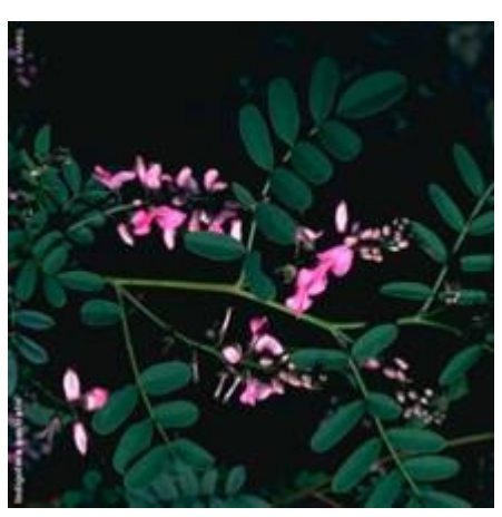
Native Indigo, Indigofera australis

Indigofera australis is a slender shrub, usually about 1-2m tall, with 7-8cm leaves consisting of numerous leaflets. It would make a lovely feature in any garden and looks particularly attractive amongst other red or yellow pea plants (which will be featured in forthcoming issues). Native Indigo grows well in all areas of the Mountains and we have good stocks at both our nurseries.